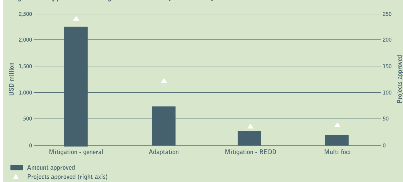
Figure 3: Approved funding across themes (2003-2016)