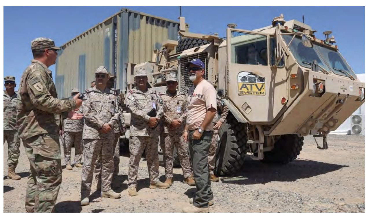
A U.S. Army Soldier with 541st Division Sustainment Support Battalion briefs the members of the Royal Saudi Armed Forces during exercise Native Fury 24 at a Logistics Support Area established in the Kingdom of Saudi Arabia, May 7, 2024.

Nevertheless, despite moments of heightened tensions during Biden's term, the security partnership proved strong enough to avoid significant disruption. For example, in the fall of 2022, when tensions between the countries erupted after OPEC+ announced that it would not boost oil production, Saudi authorities still warned the United States of an "imminent attack" from Iran which never materialized.68 This is in no small part due to the decades-long partnership that extends beyond arms sales. It includes counterterrorism cooperation; approximately 2,700 U.S. troops stationed in the country; maritime security cooperation; bilateral and multilateral military exercises; and, since 1977, a U.S. military training mission in Saudi Arabia that trains, advises, and assists the Saudi armed forces.<sup>69</sup>