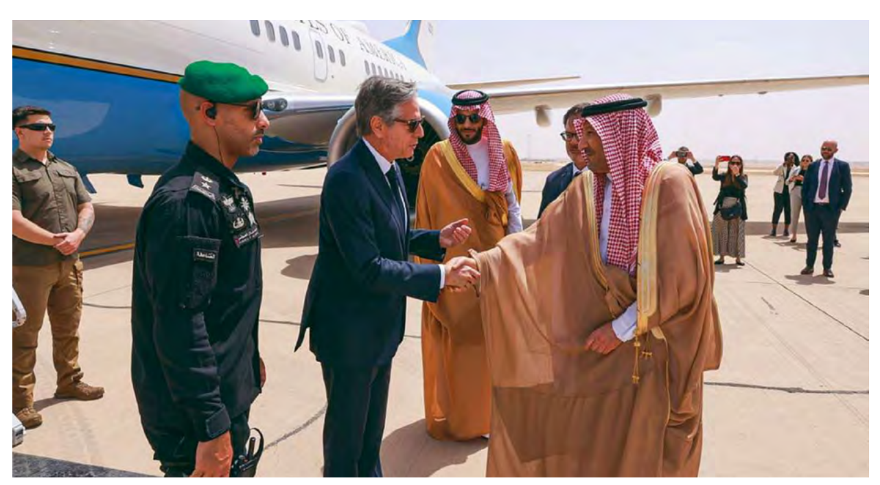
Secretary of State Antony Blinken arrives in Riyadh, Saudi Arabia and is greeted by Saudi Deputy Minister of Foreign Affairs Waleed Al-Khuraiji, on June 7, 2023.

human rights defender Mohammed al-Qahtani was also forcibly disappeared shortly before the completion of his unjust 10-year prison sentence.<sup>30</sup> The administration's failure to respond beyond a couple of concerns raised at State Department press briefings was a signal that human rights were no longer a consideration in U.S.-Saudi relations.<sup>31</sup>