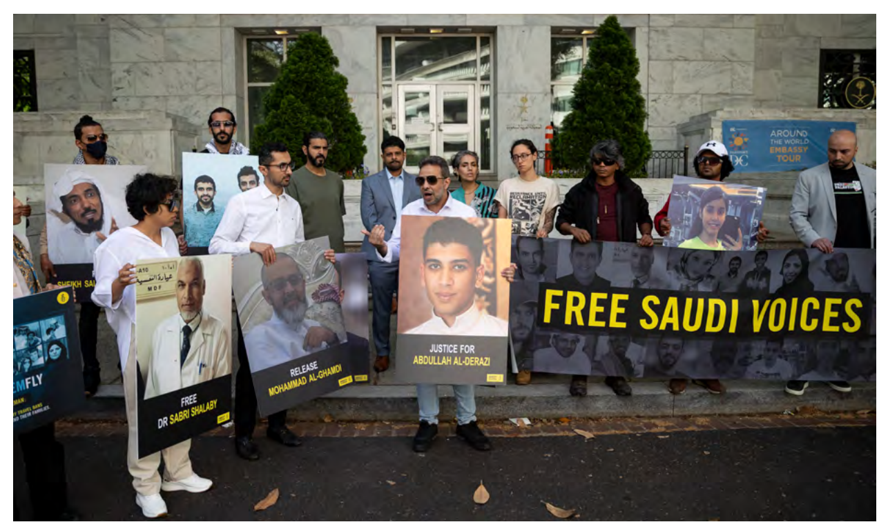
Saudi human rights defenders protest outside the Saudi embassy in Washington, May 3, 2024.

MBS also recognized that creating interpersonal conflict with administration officials when human rights issues were raised would further discourage U.S. pressure. In September 2021, the crown prince reportedly yelled at National Security Advisor Jake Sullivan when he raised the murder of Khashoggi and told him he could forget about the U.S. request to increase oil production.<sup>81</sup> This dynamic was replicated when Biden visited the kingdom and again publicly raised the case, reportedly upsetting MBS, who once again cut oil production in the months following.<sup>82</sup> After Biden's return from Jeddah, the administration effectively stopped publicly pressing Saudi Arabia about its human rights record.