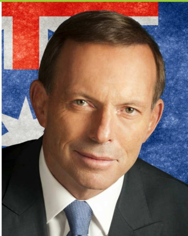
Tony Abbott "Current G20 President"