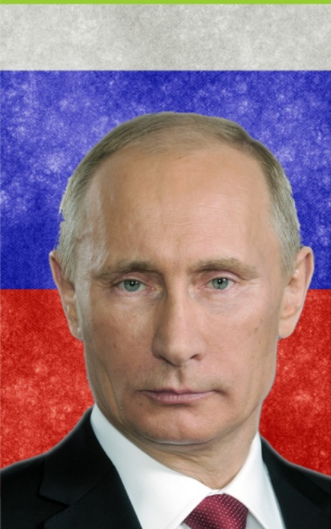
Vladimir Putin "G20 President in 2013"