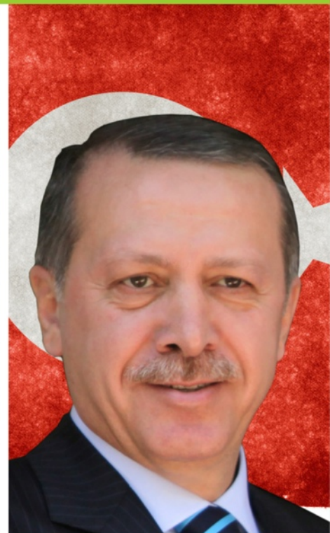
Recep Tayyip Erdoğan "G20 President in 2015"